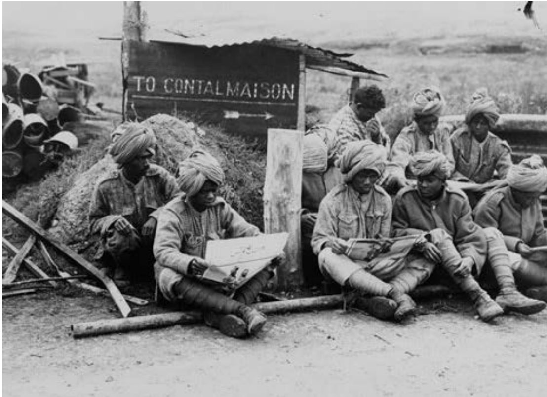
Members of an Indian Labour Battalion reading papers during a work break, c1916

and suffering further unsustainable casualties. Although the Somme did not achieve victory, many historians argue it built the foundation upon which the later victory would be achieved.