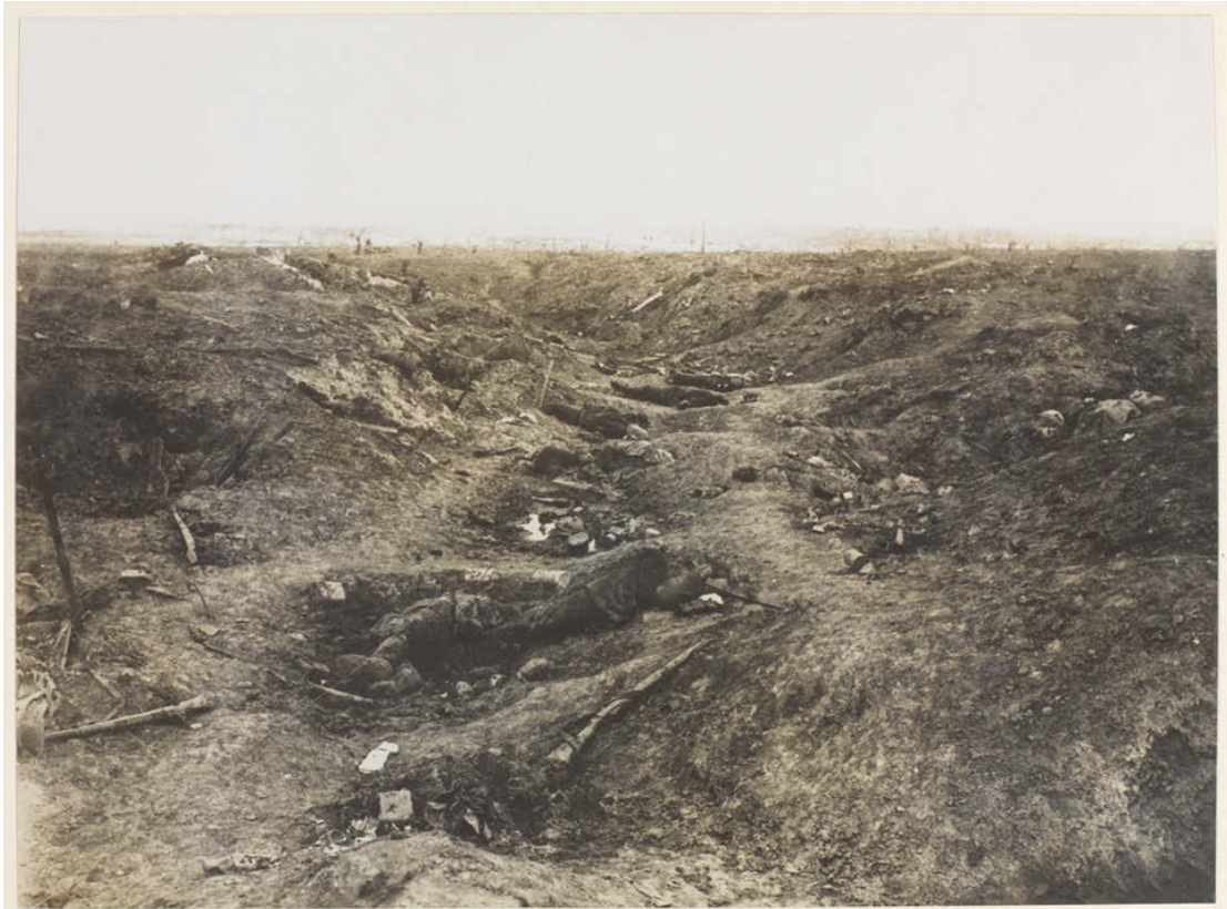
German dead on the Somme, 1916

Putting aside the disastrous First Day of the Somme, the battle actually demonstrated that the British Army was now a major military power, capable of conducting industrial warfare on scale comparable with the vast continental European armies. Although costly, they had also demonstrated it was possible to drive determined defenders from formidable defensive works, and they forced Germany to abandon much important high ground on which their early war strategies were based. Whilst continuing their offensive operations, British Empire and French forces successfully repelled German counter-attacks without their own momentum being broken.