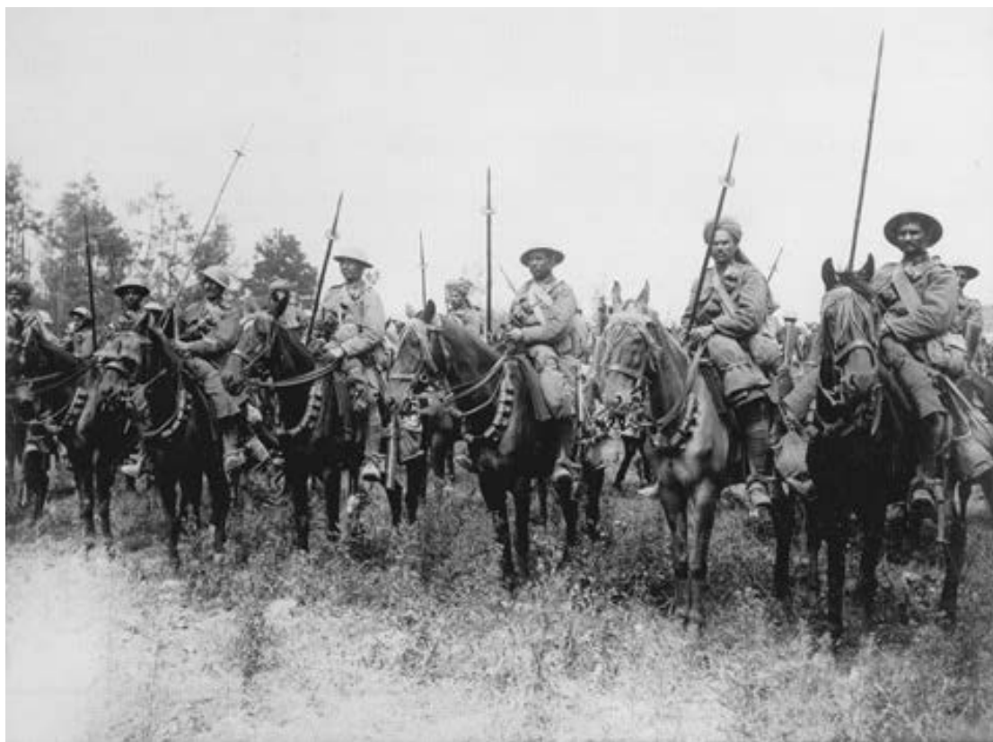
Indian cavalry await the order to advance on the Somme, 1916