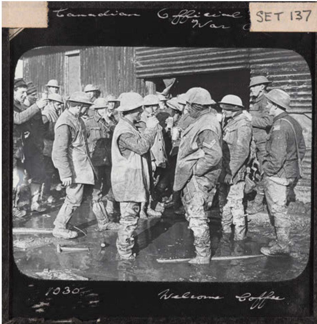
Canadian soldiers enjoy a break, 1916

Incessant fighting then broke out along the sector near Albert for the next few weeks, with a heavy attack at night involving five divisions along a front of 9,000 yards on 14 July. Although the German frontlines had been decimated by the initial artillery bombardment, the infantry and cavalry that pushed through were cut down by the artillery and machine guns of secondary defensive positions further to the German rear. The Australians entered the war on the Western Front for the first time on 19 July, launching an attack at Fromelles in search of German weaknesses in the area, and suffered terrible casualties, but eventually succeeding in capturing Pozières. By 5 September they were withdrawn, having suffered over 23,000 casualties in 45 days.