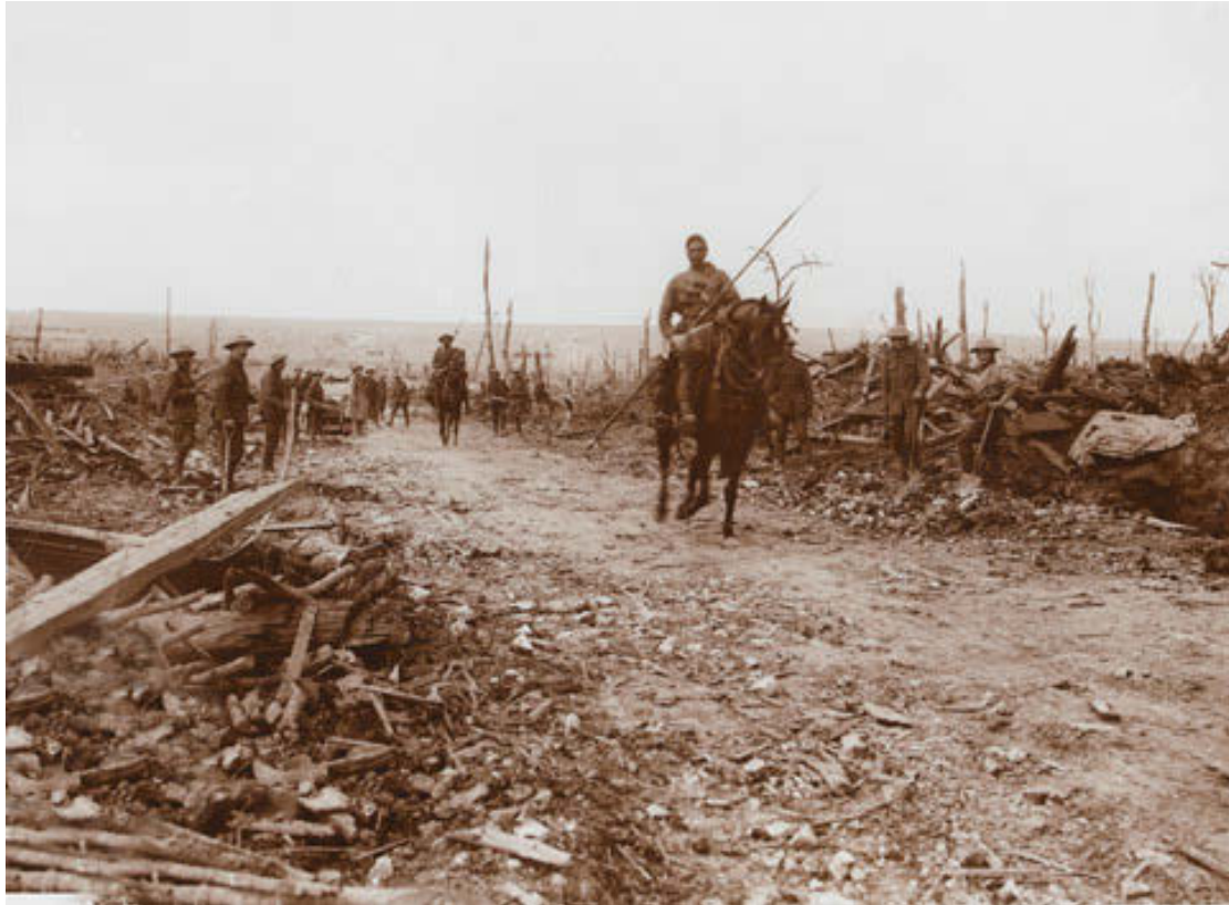
NAM. 1953-07-25-25 Sowar of 9th Hodson's Horse, c1916

Haig had hoped to break open gaps in the German line, allowing cavalry to burst through capture the strategic town of Bapaume. Instead, an advance of only 1-mile (1.6 km) on a 3.5-mile (5.6 km) front was achieved, mostly in the south with huge losses, although this was the largest amount of enemy-held territory captured since trench warfare had begun. In the north, very little had been captured at all. By the end of 1 July, 19,240 of them had been killed, and a further 38,000 were missing or wounded. The French had suffered 7,000 casualties and the Germans 8,000.