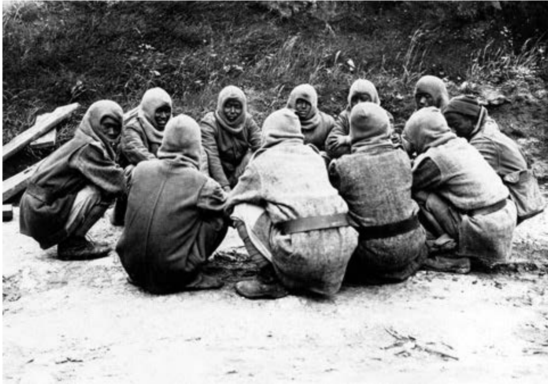
Burmese troops at Contalmaison, c1916

operations were wound up. In four and a half-months, the British and French had advanced about 6 miles (9.7 km) on the Somme, on a front of 16 miles (26 km) at a cost of over 620,000 casualties. It had taken roughly four months to achieve the first day objectives.