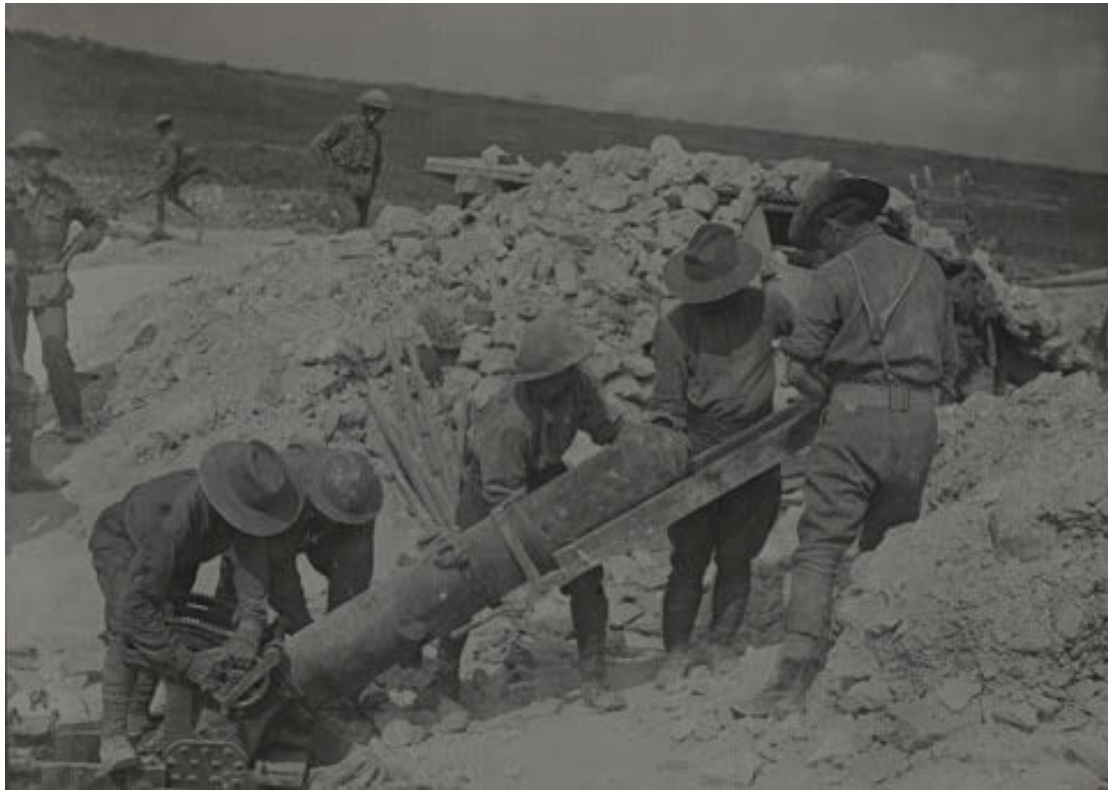
Australians loading a 9.45 inch trench mortar on the Somme, 1916

The Canadians and the New Zealanders replaced them, making their Somme debut at the Battle of Flers-Courcelette (15-22 Sept). They made significant gains on the first day, with the Canadians capturing the Courcelette village and the New Zealanders capturing the 'Switch Line', but they too couldn't achieve the desired breakthrough. The Canadian 25th Battalion (the Nova Scotia Rifles) and the French Canadian 22nd Battalion managed to hold the village for four days despite being cut off from all food and water. At the Battle of the Ancre (13-18 Nov), the Canadian 4 th Division captured the Regina Trench – the longest trench on the German frontline, and the Desire Support Trench, and Gough's British troops finally captured Beaumont Hamel and the remainder of the Thiepval Ridge – these last two objectives before Haig called off the battle were first day objectives four months earlier.