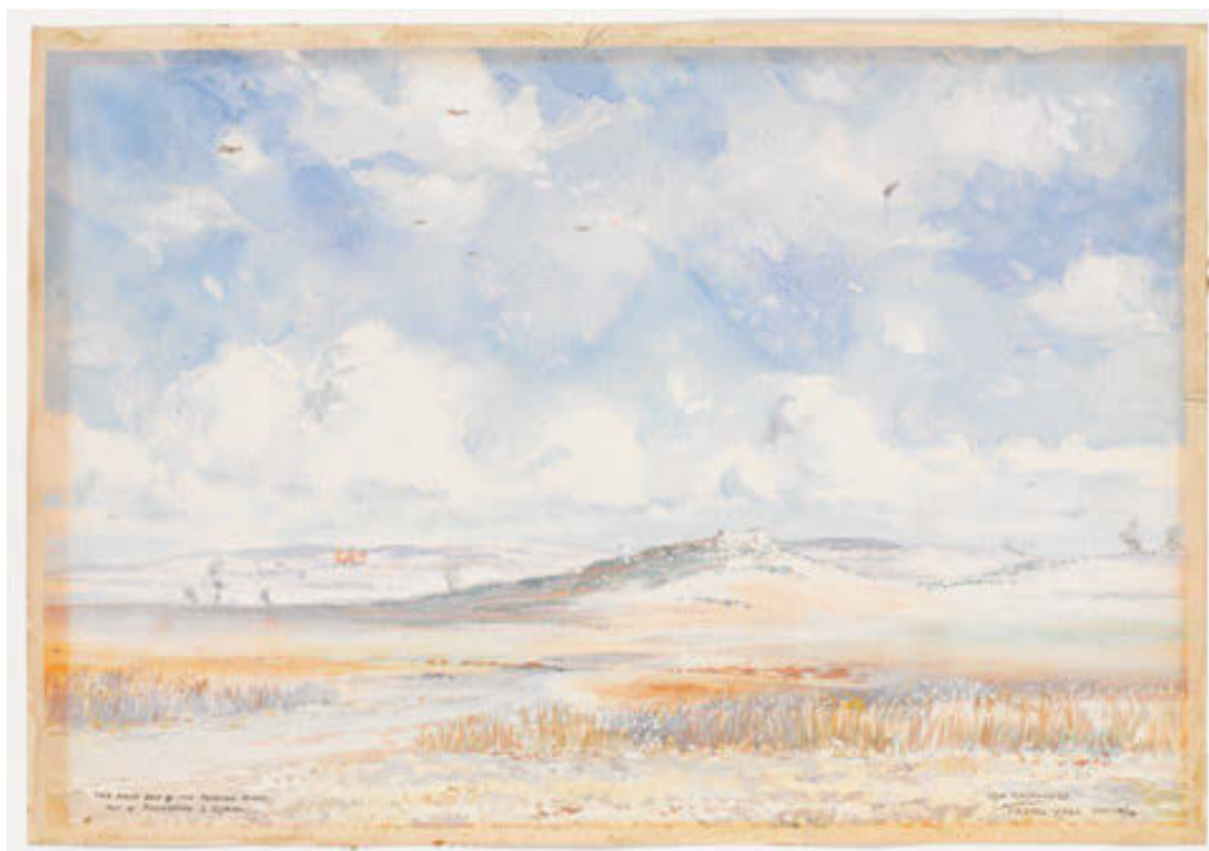
NAM. 2011-06-2-1 Battle of Meggido, 1918