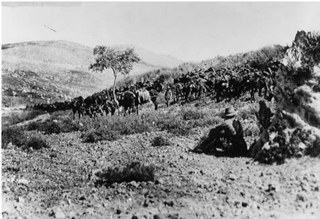
Australian cavalry waiting just outside Nablus, 1918

Having achieved the desired breakthroughs at Sharon by the evening of 19 September, the Battle of Nablus was begun with XX Corps directly attacking the Ottoman Army's well-defended frontline in the Judean Hills. A mixed mounted and infantry detached unit known as Chaytor's Force captured the vital Jordan River crossings after an artillery barrage had softened up the Ottoman Eight Army. At the same time the Ottoman Fourth Army came under sustained attack in the Hills of Moab, and at Es Salt and Amman. The battles raged throughout the night and into the next day allowing the XXI Corps to begin outflanking the Ottoman Eighth Army.