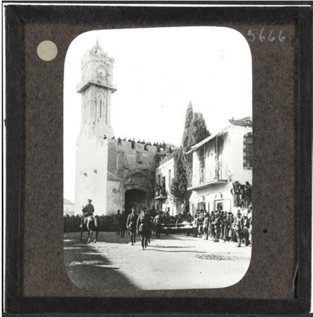
General Sir Edmund Allenby entering Jerusalem, 1917