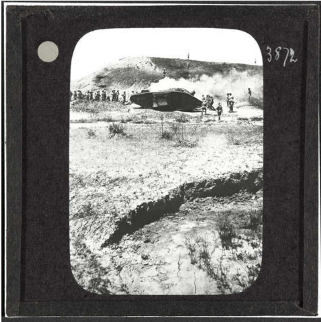
Tank advance, c1918

As the Desert Mounted Corps surrounded the Ottoman Army, Arab rebels launched hit and run attacks on the Ottoman's lines of communication. British and Indian Divisions began an all-out frontal assault, battering the Ottoman Armies at Sharon and Nablus. In the classic set-piece Battle of Sharon on 19 September, following accurate and deadly creeping artillery barrages, the infantry of XXI Corps attacked in formation, punching holes through the Ottoman defence, and allowing the Desert Mounted Corps to pour through into the Ottoman rear positions, creating havoc and sowing panic. They then advanced many miles capturing key strongholds at Afulah, Beisan, and Jenin. Over the next few days the mounted units swept through the region destroying isolated units, taking many German and Ottoman stragglers