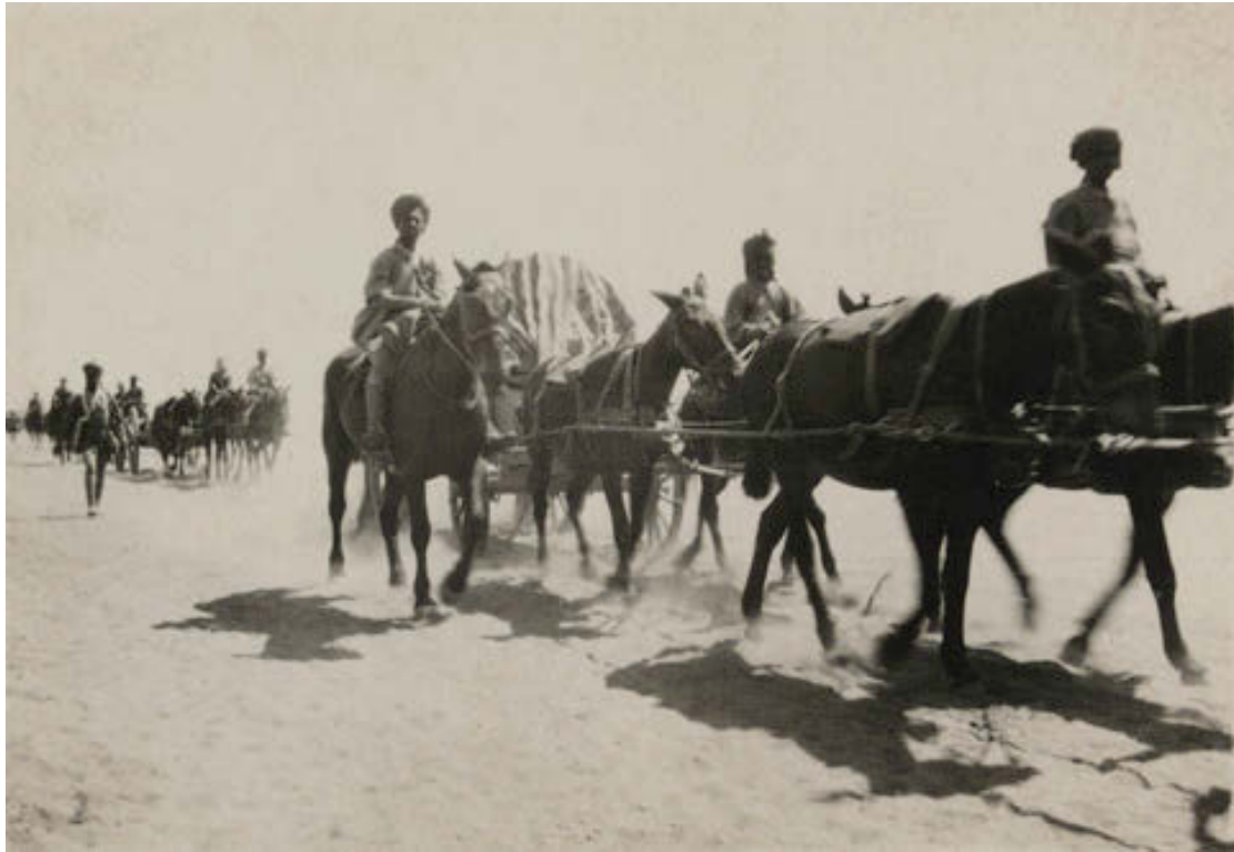
NAM. 2002-05-1-28 Indian transport crossing the desert in Palestine, 1917