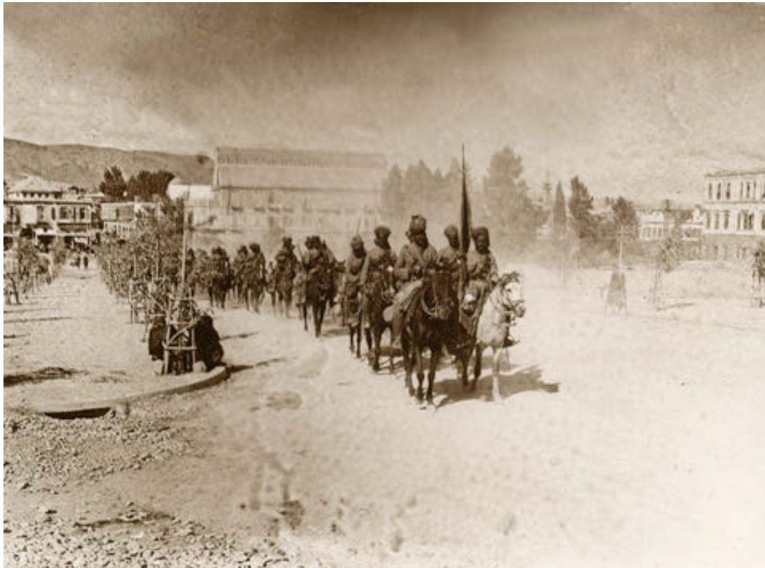
9th Hodson's Horse in General Chauvel's march through Damascus, 1918