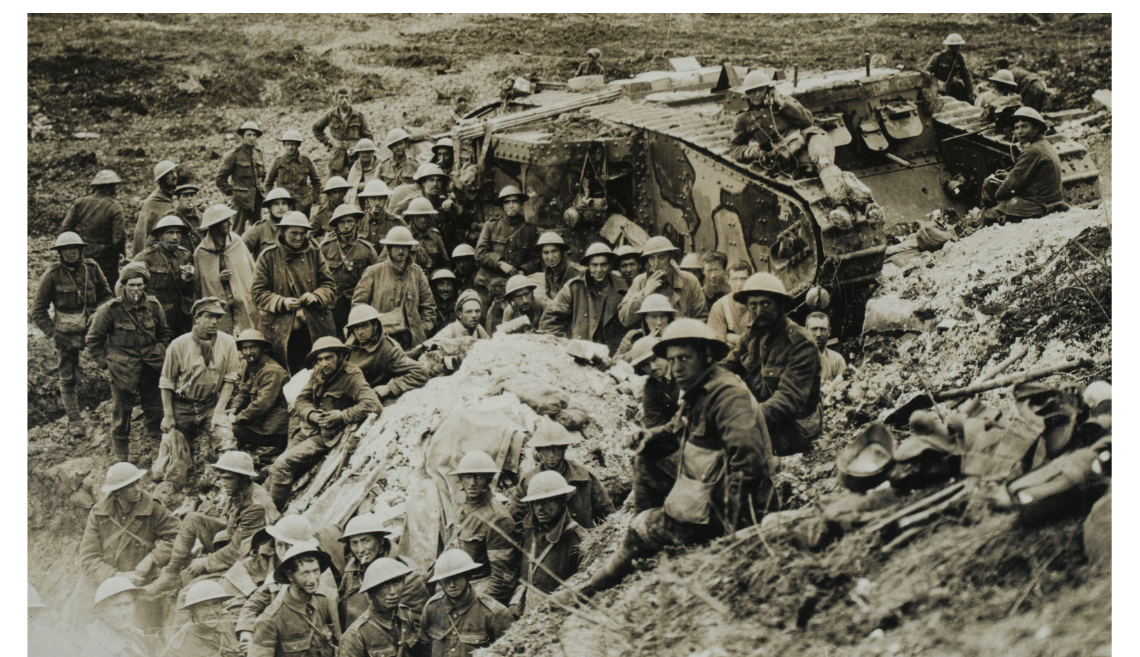
Above: One of only 15 Landships – nicknamed ‘tanks’ to keep their existence secret – to make it to enemy lines. The remaining 34 broke down or got stuck.

Ultimately, the offensive petered out with the onset of winter, when rain and snow turned the battlefield into a quagmire that left both sides literally bogged down.