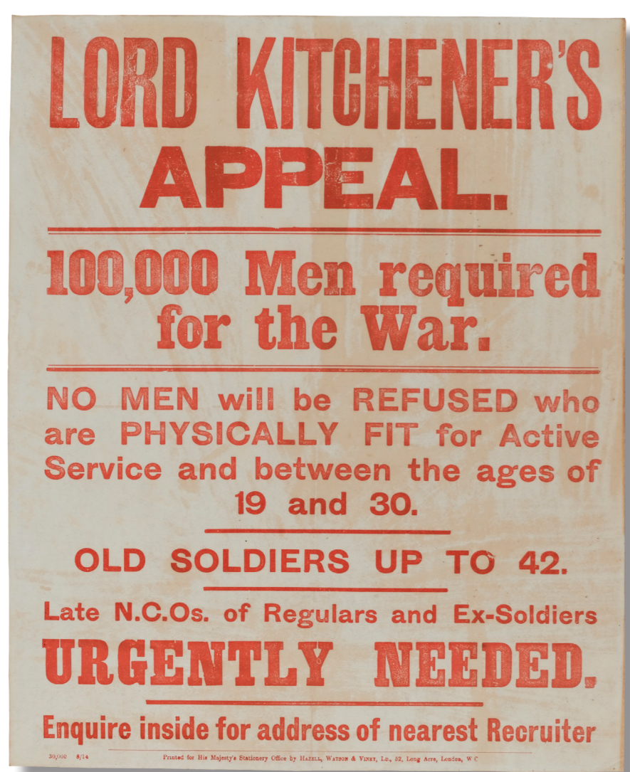
Left: Lord Herbert Kitchener, Secretary of State for War, fronted Parliament's recruitment campaign in this 1914 poster.

Since the start of the First World War in 1914, the British Army had been transformed. From a small force of highly trained professional soldiers, it had become a mass citizen army, its numbers swelled by December 1915 with the addition of more than two and a half million volunteers.