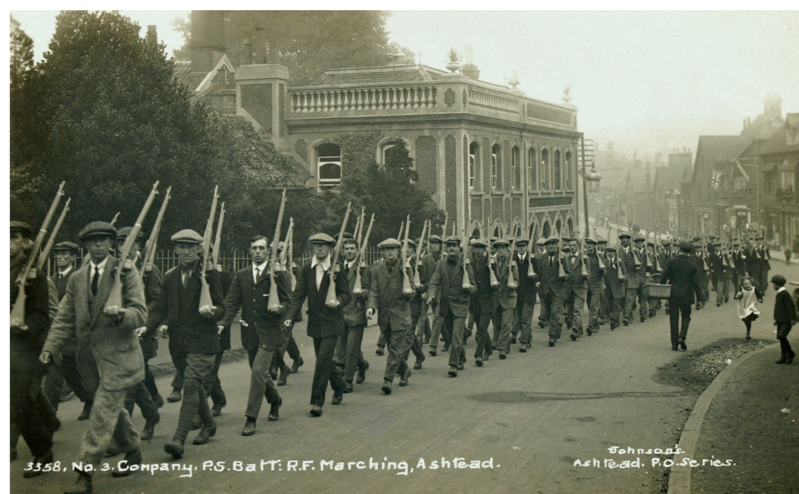
Above: New volunteer recruits in civilian dress march along a street in Ashted in 1914.

Men from all corners of the British Isles, Empire and dominions enlisted. Some joined up out of duty, some for adventure, some for a square meal and regular pay.