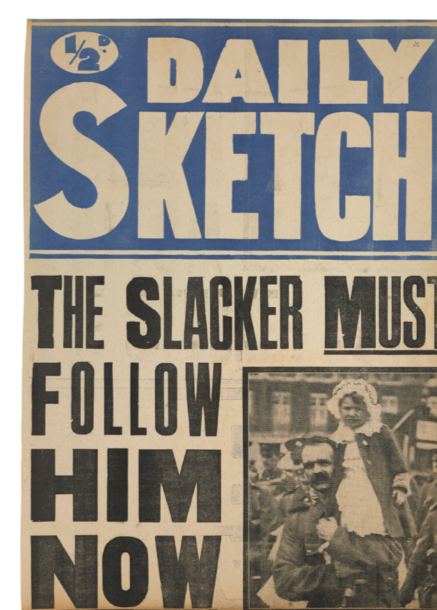
Left: While some protested against conscription in 1916, the editors of the Daily Sketch newspaper clearly thought it was a good idea.

Prime Minister Herbert Asquith introducing the Military Service Bill to Parliament, January 1916