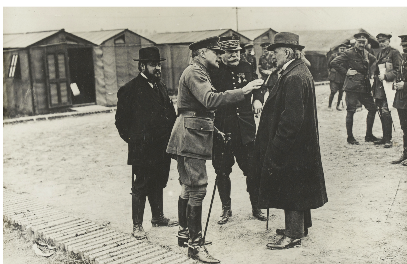
Above: Right to left, the British Minister of War, David Lloyd George, Douglas Haig, the French commander-in-chief Joseph Joffre and the French Under Secretary for Munitions, Albert Thomas, discuss the ongoing offensive on the Somme.

The week-long bombardment failed to destroy much of the German defences, although it did serve to announce the long-anticipated Anglo-French attack. As soon as the shelling stopped, the German defenders, who'd been sheltering in relative safety, returned to their positions and engaged the advancing army.