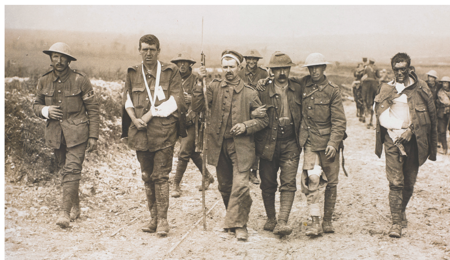
Above: A wounded German prisoner of war assists wounded British soldiers on the Somme front in July 1916.

And the cost? Some 620,000 British and French troops dead or wounded; perhaps the same number again on the German side.