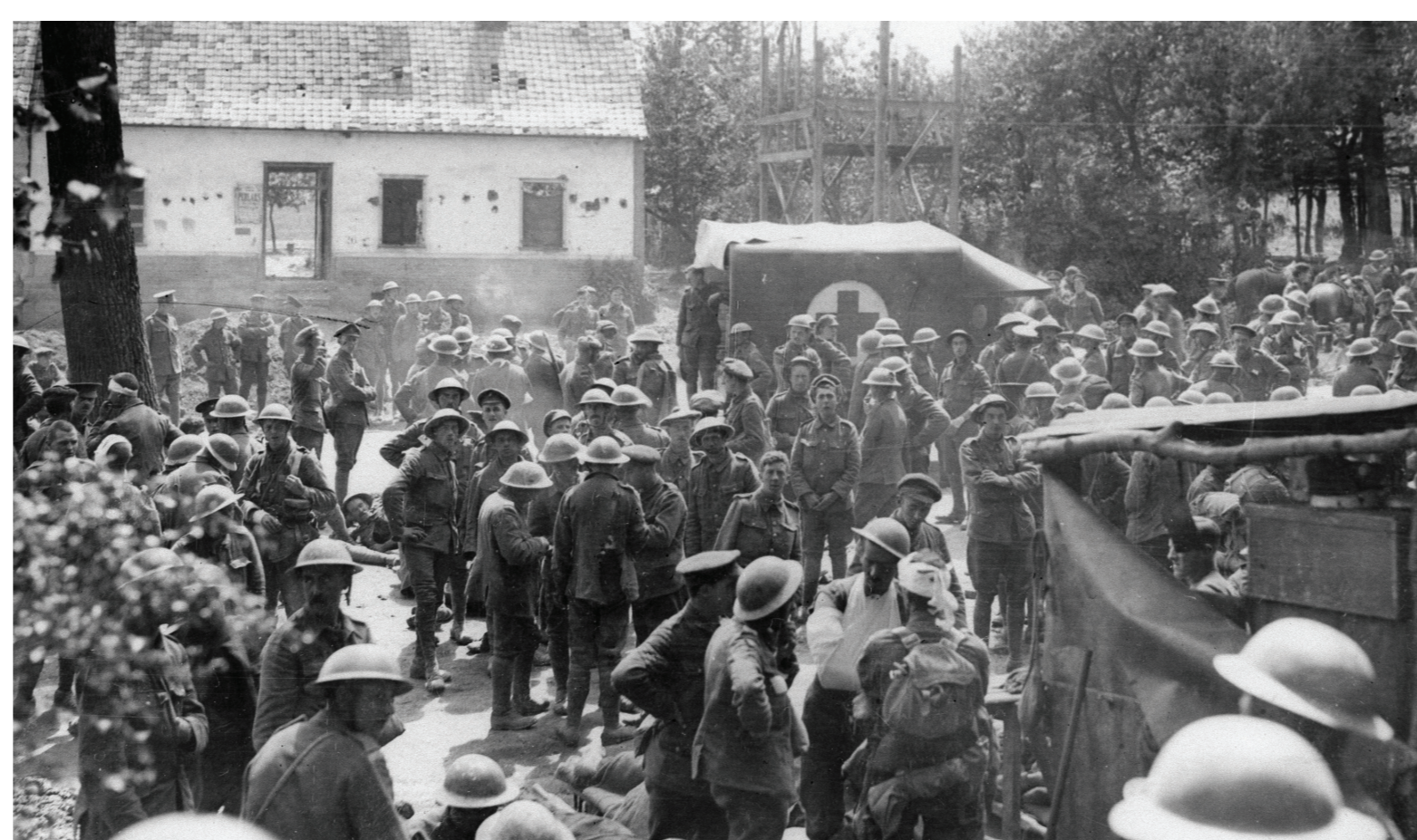
Above: British wounded at an advanced dressing station behind the Somme front, 1916.